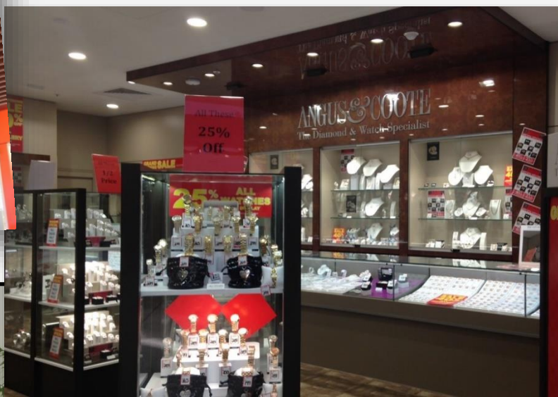
Above - Angus & Coote stores Copper pattern reverse printed on 6mm Acrylic panels