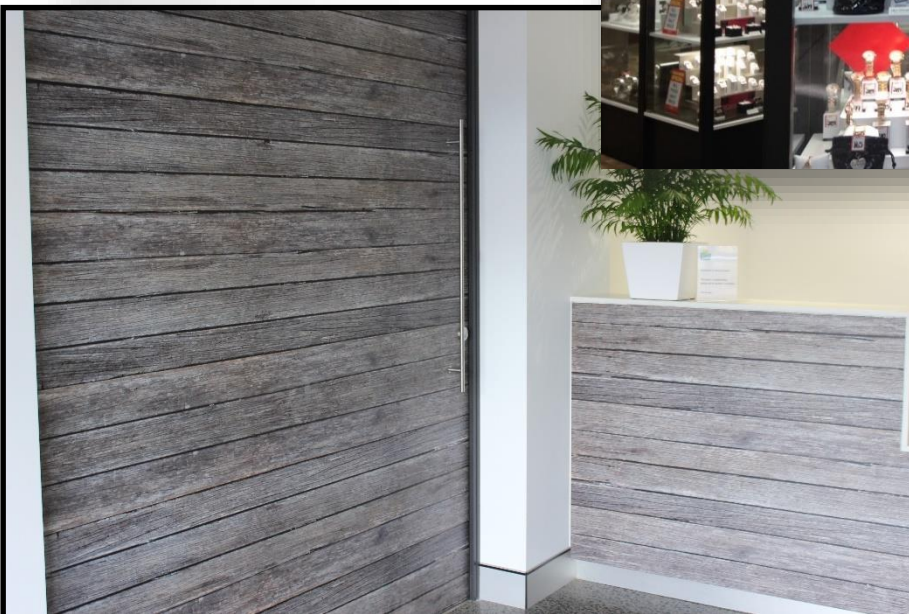
Left – Large Balsa core door printed with textured woodgrain for Sunny Queen eggs head office. Carole Park QLD