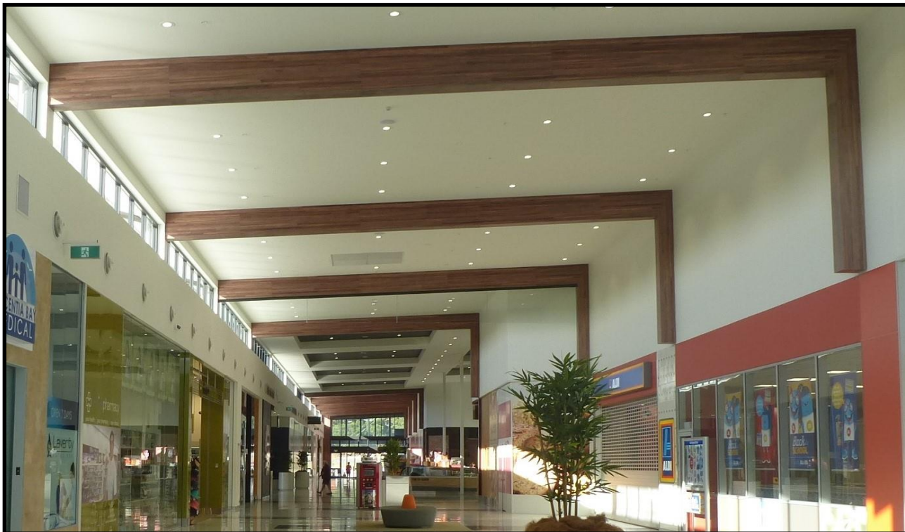
Above – Grey Ironbark timber printed onto MDF made into box beams to conceal steel girders