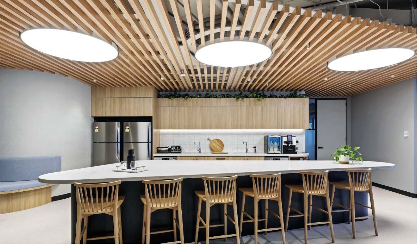
Scottish Pacific Offices—Sydney Shopfitter: Woodland Shopfitting Product: Ecolite beams with Spotted Gum imagery