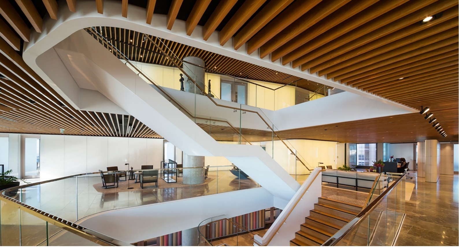
Herbert Smith Freehills Law Firm—Sydney Product: Ecolite American Cherry timber veneer beams

Our Ecolite beams and panels have been installed in many corporate offices across Australia. The Ecolite beams can be applied with many surfaces including creative imagery, natural timber veneer, laminate and paint.