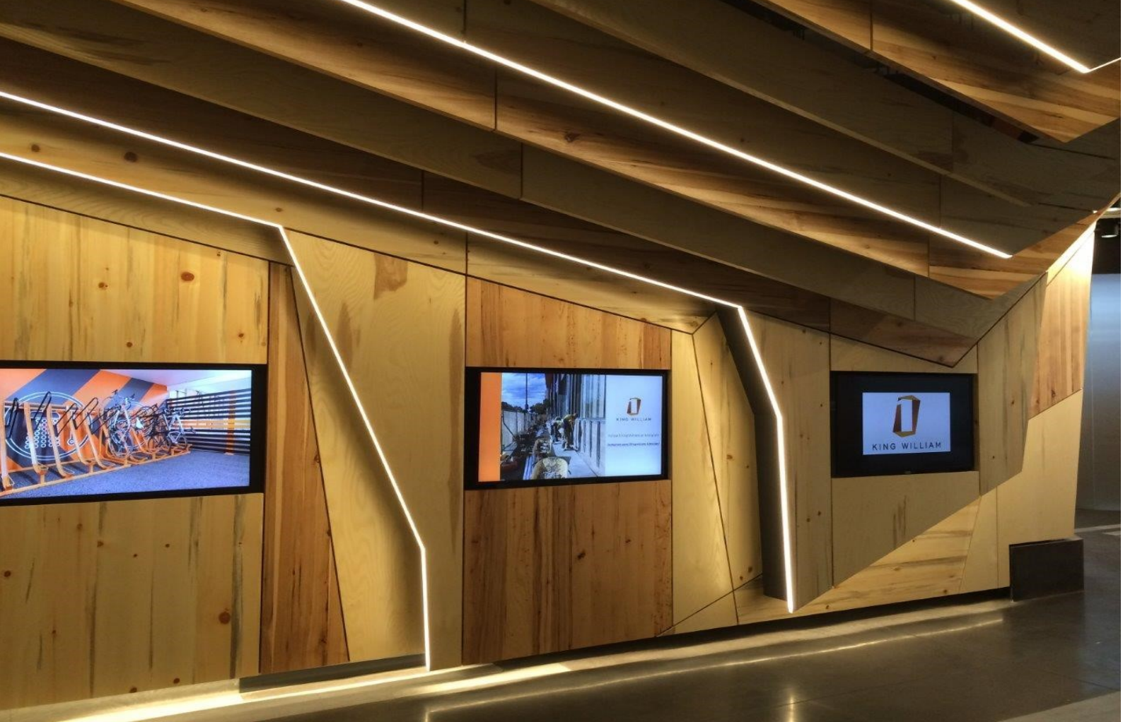
1 King William St, Adelaide Architect: IA Design Joiner: Spry & Spry Product: 35mm thick Ecolite panels with rustic veneer overlay