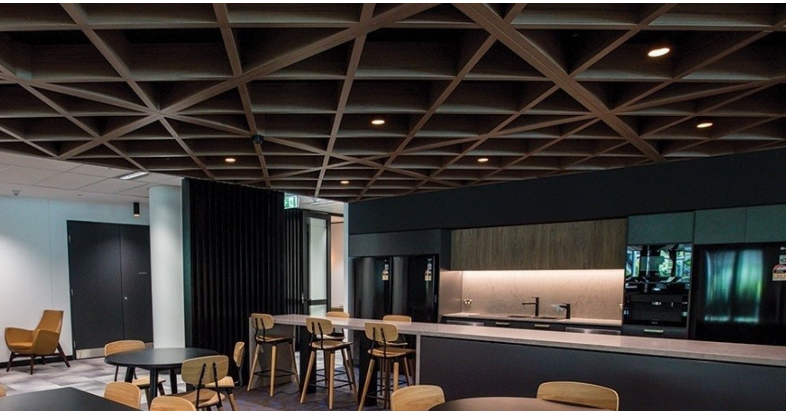
Theiss Head Office—Southbank Brisbane Installer : In 2 Joinery Product: Ecolite Walnut imagery

With lightweight Balsa as the core material, Ecolite beams have distinct advantages in installation costs and the ability to create interesting profiles.