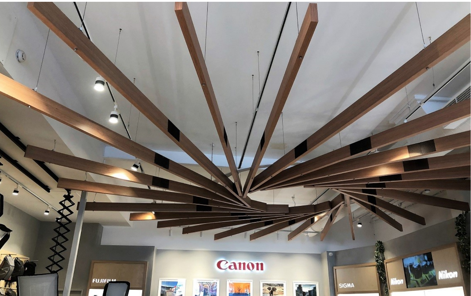
Camera Pro—Brisbane Designer: Troupe Studio Product: Ecolite beams with Tasmanian Oak imagery