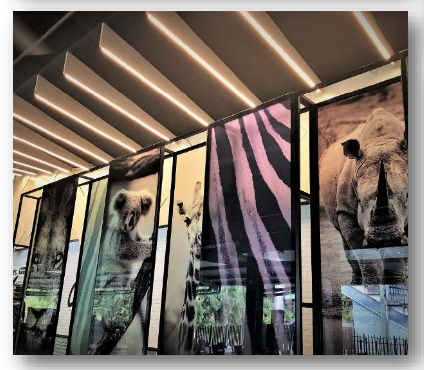
Clear Acrylic panels with DP