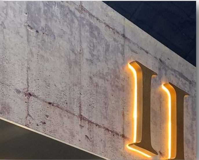
Concrete DP on MDF panels