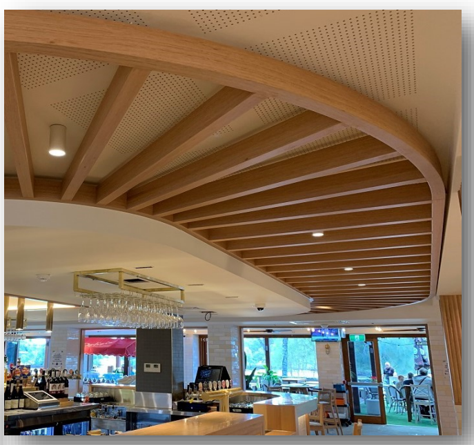
Ecolite Beams produced from Balsa/MDF core