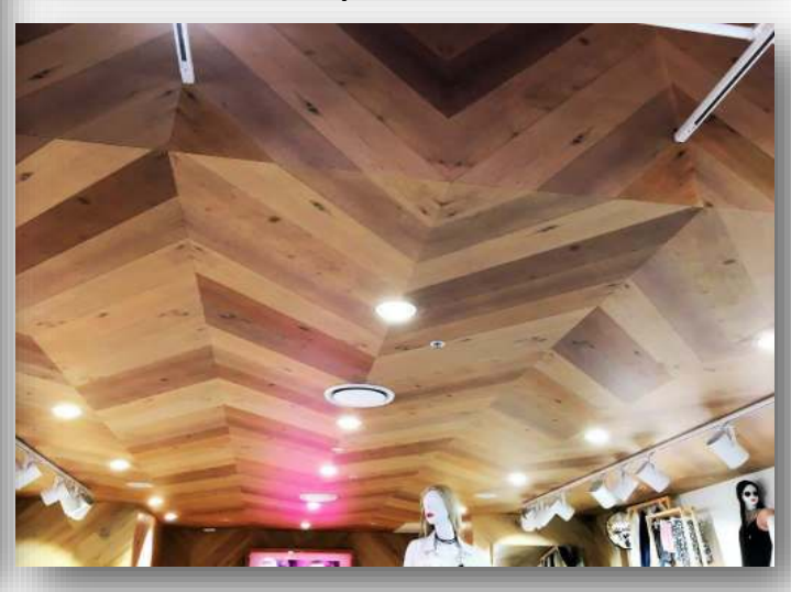
Group 2 FR MDF substrate with Chevron timber