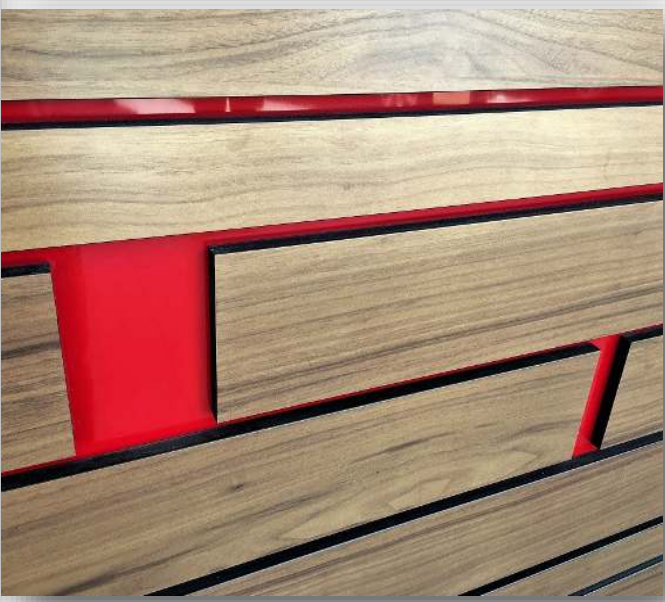
Black core Foamboard with Walnut DP

Gen-Eco's Creative Imagery process can utilise the following formats: