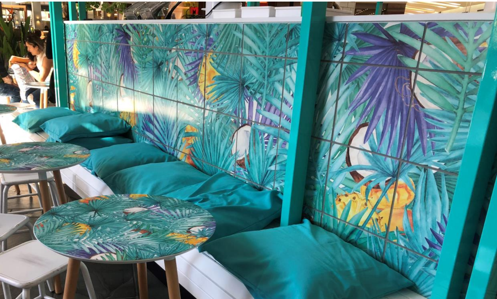
Coco Bliss—North Lakes QLD Shopfitter: Fix It Up Product: Versipanel imagery of corporate graphic on CFC tiles.

Versipanel opens up a world of opportunities for architects and designers.