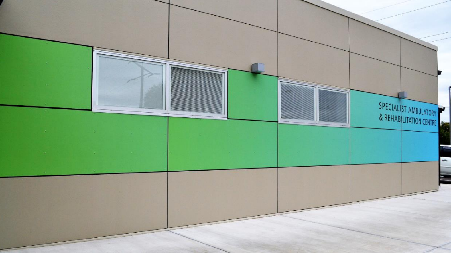
Modbury Hospital—Adelaide Architect GHD Builder: Built Environs Product: CFC panel with and anti-graffiti coating.

Where panels are exposed to direct sunlight, we can provide UV coatings and for areas of high traffic, the panels can also be coated with anti-graffiti protection.