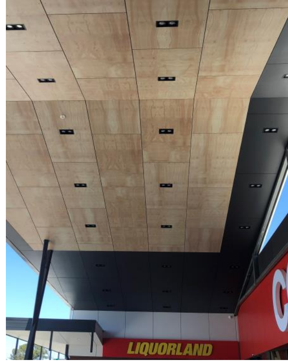
Karalee Shopping Centre QLD: Builder Hutchinson Builders

The panels can be coated with standard UV protection plus UV & Anti-Graffiti for low areas that may be subject to malicious damage.