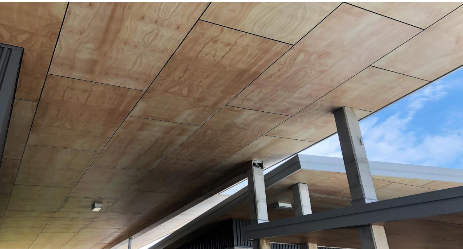
Pottsville High School - NSW Architect: Conrad & Gargett Installer: Ideal Commercial Linings