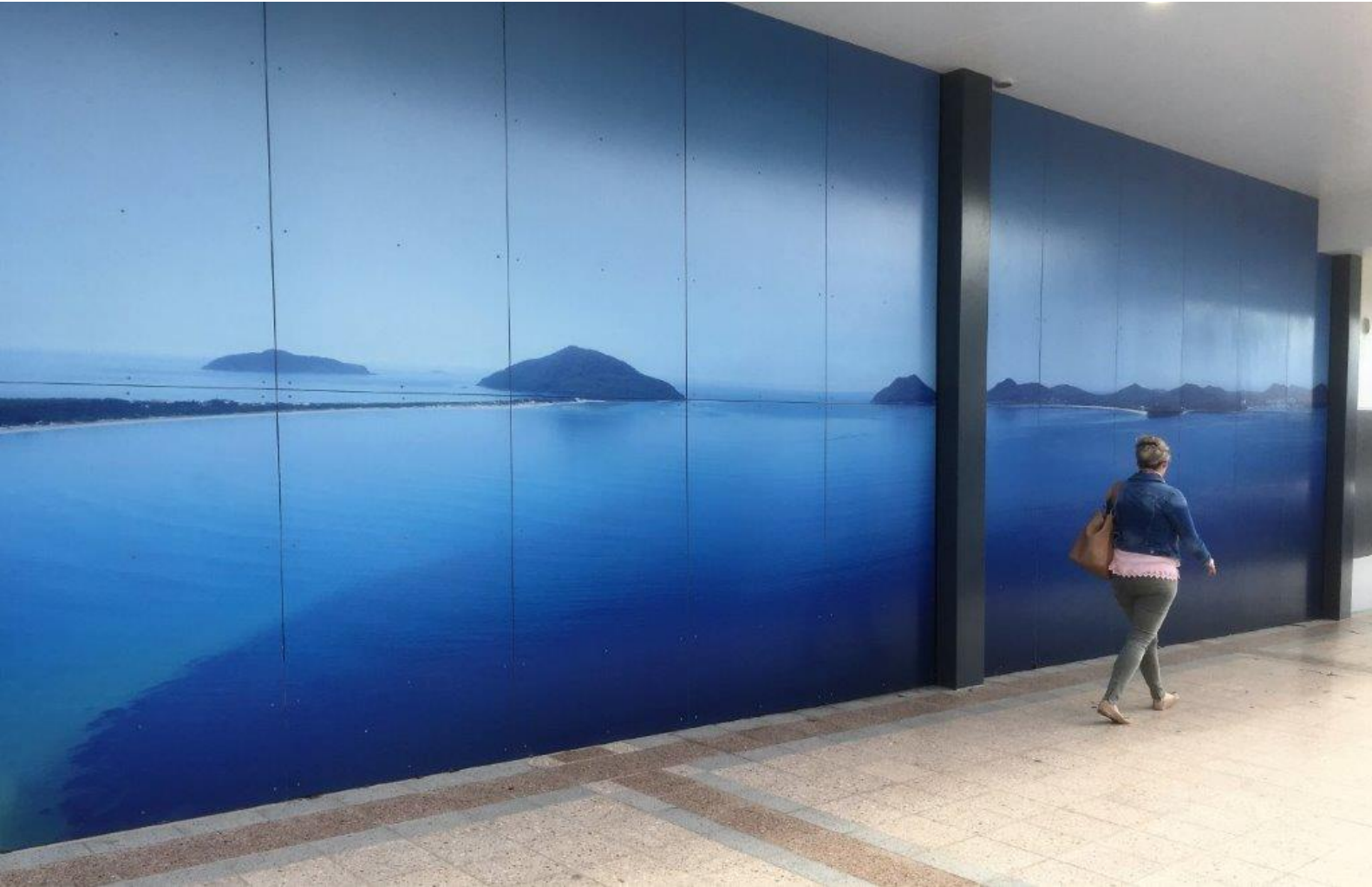
Woolworths—Nelson Bay NSW : Drone photograph of Nelson Bay imagery onto CFC panels. Anti-Graffiti coating applied

Where panels are exposed to direct sunlight, we can provide UV coatings and for areas of high traffic, the panels can also be coated with anti-graffiti protection.