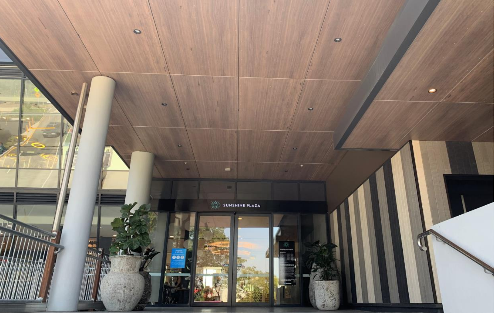
Sunshine Plaza—Maroochydore QLD : Architect—Buchan Group : Product—Spotted Gum imagery on CFC panels