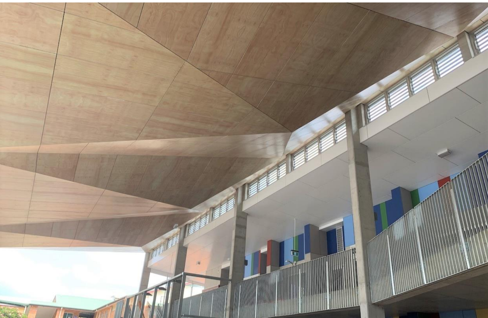
Wauchope Public School—NSW Architect: Conrad Gargett Builder : Lahey Const Installer : Goal Interiors Product : Hoop Pine imagery on FC panels