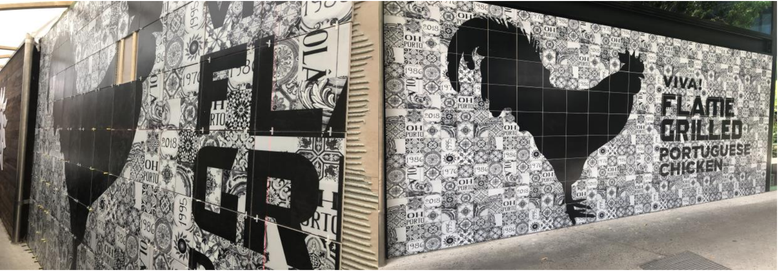
Oporto Chicken—North Lakes QLD Product: Oporto graphic imagery on Versipanel FC panels. Panels cut into tiles prior to

Another expanding niche market for us is applying custom graphics onto fibre cement which has been cut into tiles. This allows walls to be tiled in external situations but incorporating the clients graphic images.