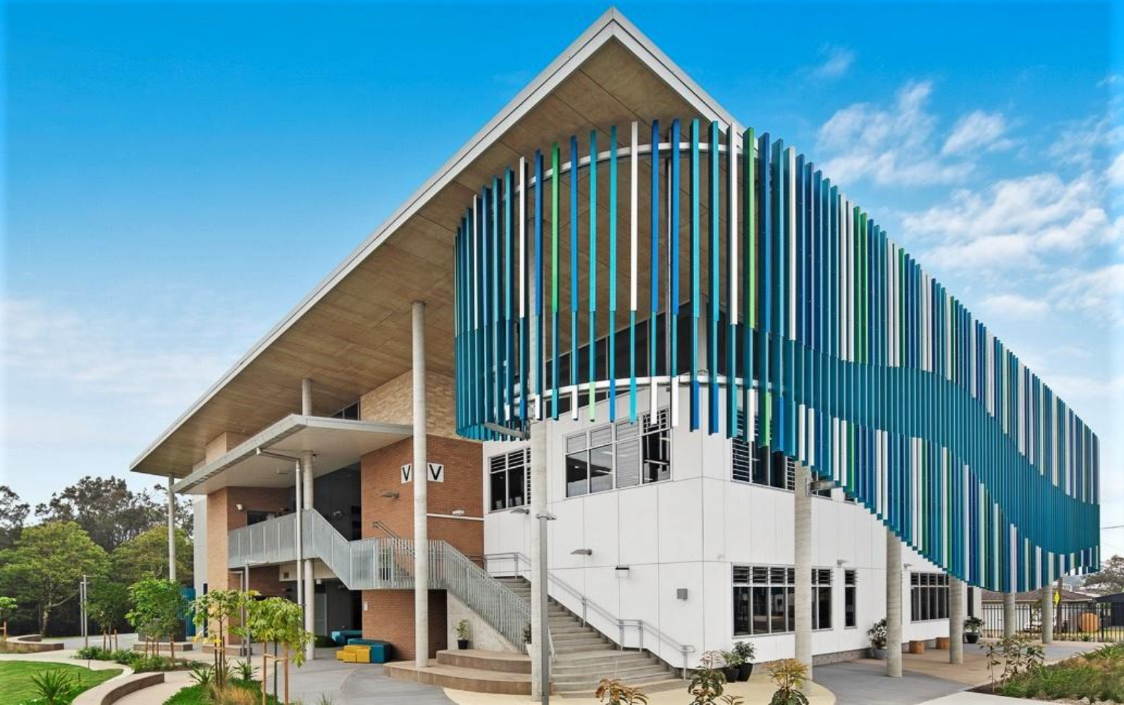
Old Bar Public School—NSW : Architect—Conrad Gargett : Builder—Lipman : Versipanel Hoop Pine imagery on CFC